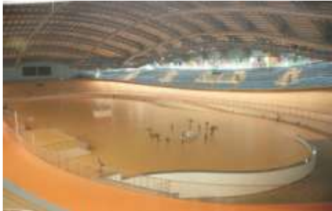
Inside view of Cycling Velodrome Major Dhyan Chand National Stadium

Earlier Known as the National Stadium, the venue was first re-modelled for the 1<sup>st</sup> Asian Games in 1951 and then upgraded for Asian Games1982 and thereafter for the Commonwealth Games 2010. It has a heritage wing and is referred to as "The Temple of Indian Hockey". It has 3 Artificial Hockey Turfs and a seating capacity of 20,000 persons. During the Commonwealth Games 2010, all events of Hockey were held in the Major Dhyan Chand National Stadium.